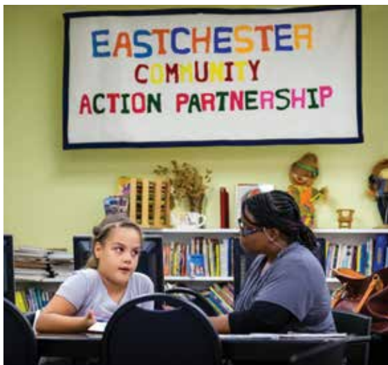
Homework help at the Books & Beyond After-School Program at ECAP

BACK INTO THE BET COMMUNITY THROUGH LOCAL NON-PROFIT ORGANIZATIONS, SOCIAL SERVICE AGENCIES AND COMMUNITY PROGRAMS.