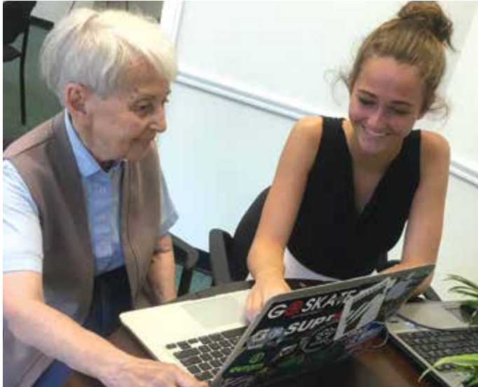
Gramatan Village volunteer teaches computer skills

the Shopping Chores & More Transportation Program and Sundays at Concordia. www.eastchester.org/departments/senior_programs_and_services