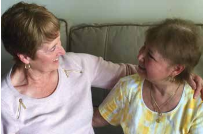
Cancer Support Team staff provides professional caring services

Cancer Support Team, Inc. – offers a comprehensive program of free services at any stage of the disease for cancer patients and their families living in lower Westchester including nursing, counseling, education, case management and other supportive services. CF dollars provide financial support for their work in the BET community. www.cancersupportteam.org