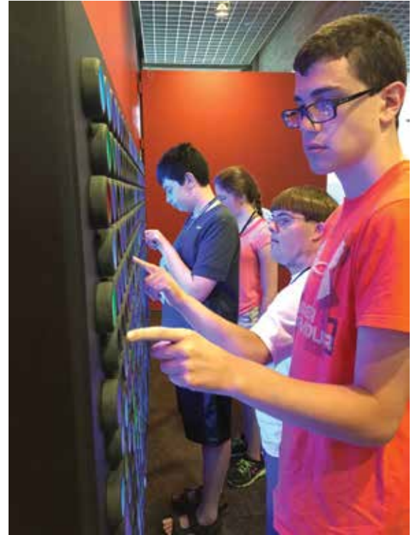
South East Consortium teens enjoy hands-on science exhibit

Westchester Community Opportunity Program Inc. (WESTCOP) / Victims Assistance Services – provides free and confidential services for BET residents who are at risk or are victims of violence and serious crime such as robbery, burglary, identity theft, stalking, domestic violence, dating violence, sexual assault, child or elder abuse, child abduction, kidnapping, terrorism and services to the loved ones of homicide victims. VAS offers 24/7 Rape Crisis Hotline and SAFE (Sexual Assault Forensic Examiner) Program at local hospitals. CF dollars support services provided to victims residing within the BET community. www.westcop.org/WP/victims-assistance